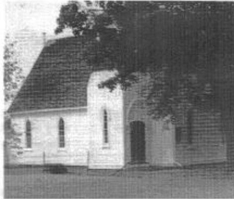
Silas James United Church Apohaqui, NB