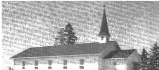
Kings Kirk United Church Belleisle Creek, NB