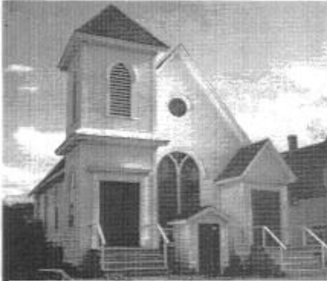
St. Andrews United Church Norton, NB